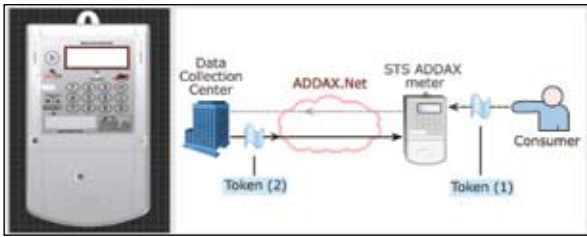
Figure 2 - Simple ADDAX STS compatible meter

combines STS and AMM technologies, thereby allowing utilities to move to new technologies and requirements in a secure way. ADDAX Prepayment was developed on the proven ADDAX AMM platform, which has a global pedigree and provides for a truly integrated (water, electricity, gas, heat and street light metering) utility metering solution. The ADDAX AMM comprises different end-point devices (electricity meters, customer displays, MIU, etc.) and networking equipment for data transmission.